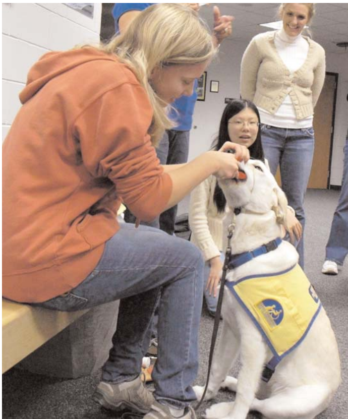
An Interact member learns how to brush the teeth of service dog Flash while other members look on.