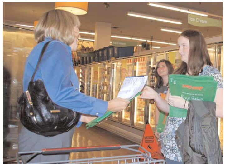
LEAF members explain the club's new green partnership with Jewel-Osco and offer a recyclable bag to a shopper.

A new green partnership has been formed between Jewel-Osco, Libertyville High School and the Libertyville community. On Oct. 29, LEAF kicked off a long-term fundraiser with Jewel-Osco in Libertyville. When a customer visits the Jewel-Osco in Libertyville and uses a reusable bag, 5 cents will be donated to our LEAF program. A donation slip is provided to the customer at check out and then placed in donation boxes located at store exits/entrances. This partnership brings together three great organizations for one common goal: to improve environmental awareness in our community by promoting reusable bag use and reducing paper and plastic bag waste.