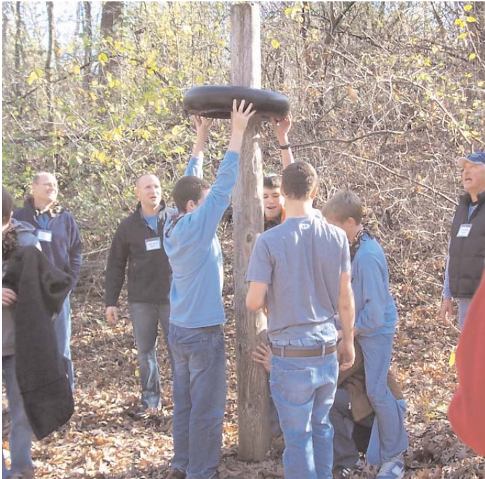
Students participate in a team-building activity during Operation Snowball on Nov. 5.

More than 100 District 128 students joined students from Barrington High School for Operation Snowball, a day-long event held Thursday, Nov. 5, at YMCA Camp MacLean in Burlington, Wis. Activities included presentations by motivational speakers, small groups, and team-building activities.