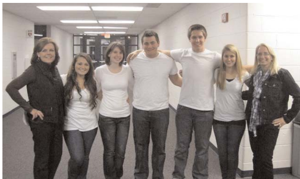
The Student Council Executive Board and their sponsors.