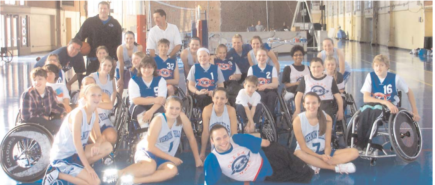
Members of the VHHS sophomore girls' basketball team and players from the Great Lakes Adaptive Sports Association take time out from a wheelchair basketball scrimmage.

I had the pleasure to speak with the four qualifiers the day before the state finals.