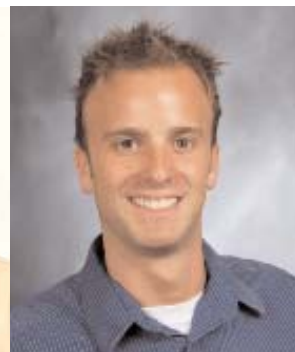
John Taylor Girls' Gymnastics