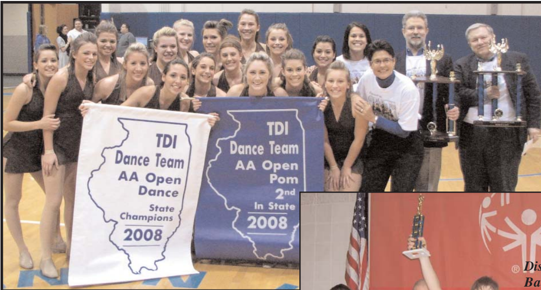
Vernon Hills High School Poms

District 128 Salutes its State Champions!