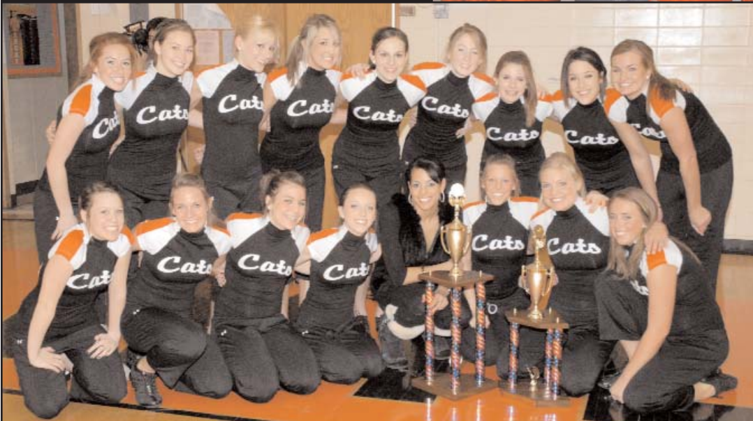
Libertyville High School Poms