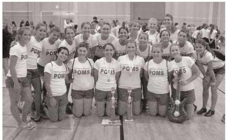
The VHHS Cougar Dance Team poses at the UDA summer camp held at NIU.