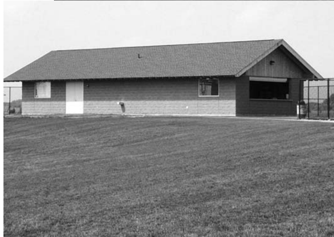
Above: The new entry and addition at LHS. At left: The rest room/concession/storage building at VHHS

Community High School District 128 940 W. Park Ave. Libertyville, Illinois 60048 847.367.3159 www.d128.org