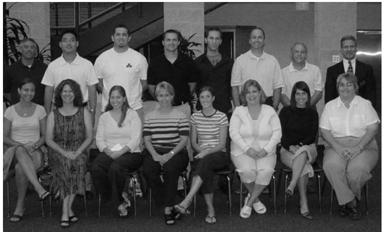
Vernon Hills High School new staff members