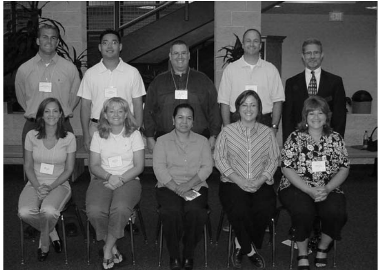
Libertyville High School new staff members