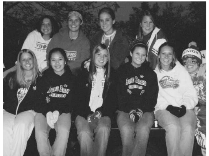
VHHS 2003 Homecoming Court